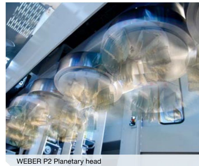
WEBER P2 Planetary head

Regarding the planetary head, WEBER sets new quality standards for sanding. This patented unit ensures a perfect surface independently of the direction of the wood fibres or the shape of the workpiece. It breaks all edges uniformly during its passage. It can also be used to machine 3D surfaces, radii and profiles. During the subsequent lacquering process, the wood fibres practically no longer rise. This helps to save lacquer and to improve the surface quality.