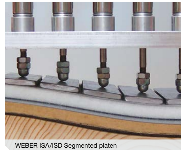
WEBER ISA/ISD Segmented platen

A sanded surface free of traces of oscillation is an outstanding quality benchmark. For WEBER, CBF technology has provided the solution. It works using a crosswise running lamella belt which moves transversely within the wide belt station. The pressure lamellas interrupt engagement of the abrasive grains, thus avoiding undesired oscillating stress marks by the sanding belt. The result is a smooth and even surface. The slat belt moves without control system, is subject to the full tolerance compensation of the segmented platen and to uniform wear and can be replaced at low cost.